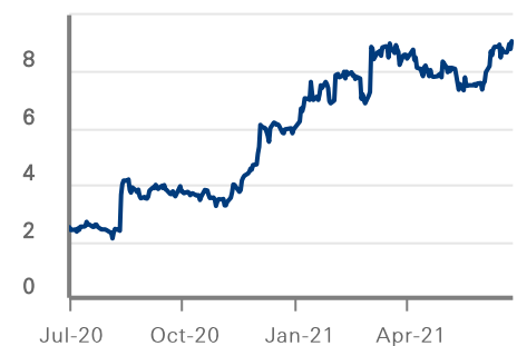
Price (in EUR)